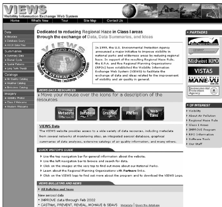
Figure 1. The home page of the new Visibility Information Exchange Web System.

To facilitate usage of the various tools, "quick user guides" have been created on a number of the pages to provide tips and instructions on how to use the Web site. Users can now register to be notified by e-mail of major additions or updates to the IEWS Web site, including the addition of new datasets to the IEWS integrated database.